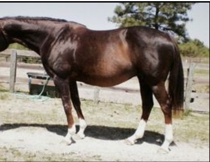
Explosive Red TB-CA/US-90-CH